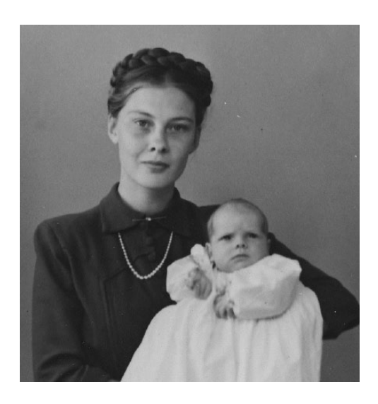
Figure 1 My favourite patient (5 weeks old)

Despite training Foulkes was not optimistic about the therapists gain: